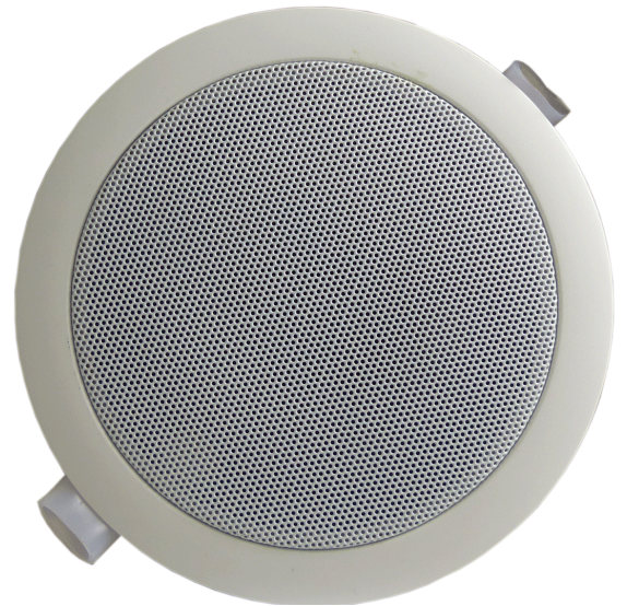
SP-100 White 100mm Speaker